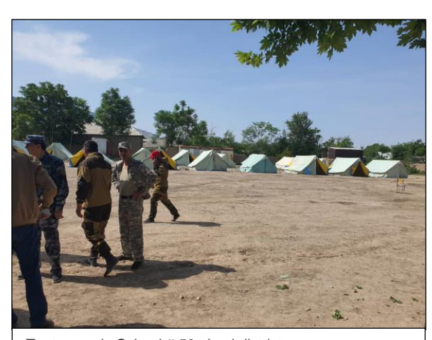
Tent camp in School # 50, Jomi district