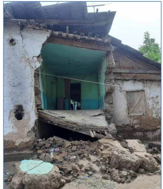
Damaged house in Kulob city, 12 May 2021

Response operation in Kulob city is facilitated by the Republican Commission led by the Prime Minister.