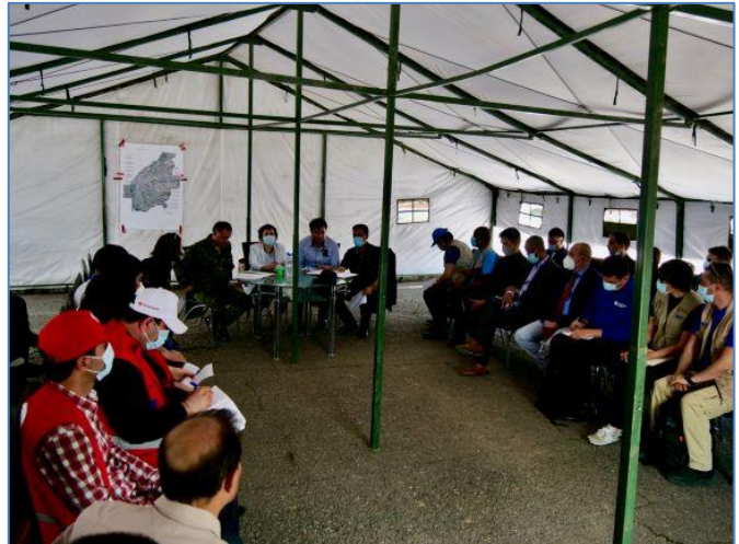
REACT meeting in Kulob, 14 May 2021

Up to date, REACT partners (UNICEF, RCST, AKAH, WFP and UNDP) have delivered some relief items, including fuel, hygiene and dignity kits, sets of household items and food aid to the affected population in Jomi district and Kulob city. Detailed overview of provided assistance will be provided in next report.