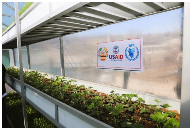
WFP supports Tajik farmers to adopt vertical farming and produce large quantities of quality crops year-round.